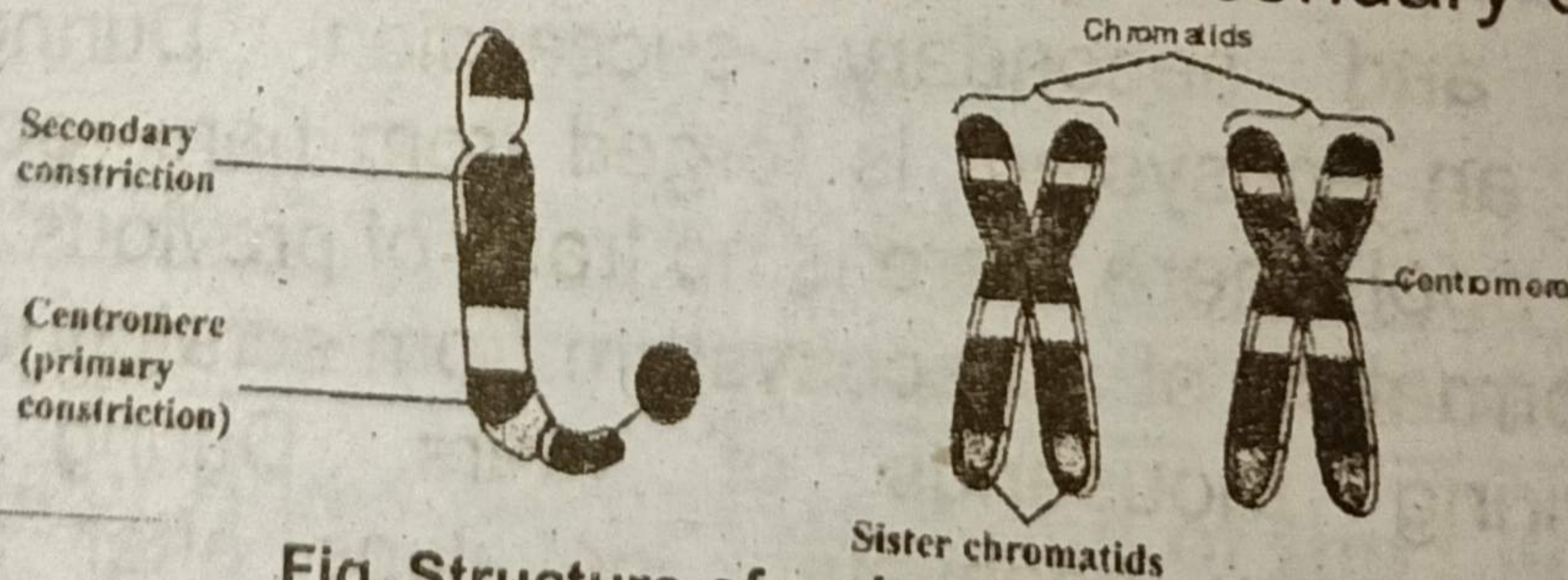
Fig. Structure of a chromosome.

Typically, a chromosome is made of two chromatids, a centromere (primary constriction), and a secondary constriction.